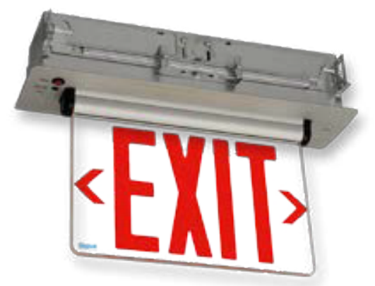
VERSA Series Recessed Mount Edge-Lit

The battery backup model for the VERSA is outfitted with a maintenance free, nickel cadmium exit sign battery. The battery features a 24-hour recharge time and provide 90-minutes of emergency run time. Comes standard with a current charge regulator. Simply press the external test button to satisfy monthly and yearly testing requirements.